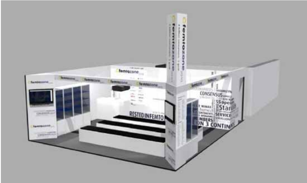
FemtoZone stand plan, MWC, 2010

The FemtoZone consists of a stand with seating area; approx 48sqm.